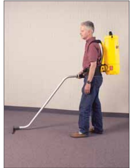
PRO PAC VAC®