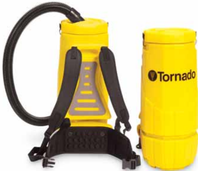
SUPER PRO PAC VAC®